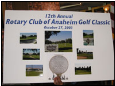
The Rotary Club of Anaheim 12th Annual Golf Classic Poster