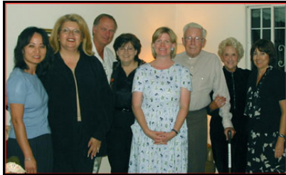
Fireside Chat Fun!