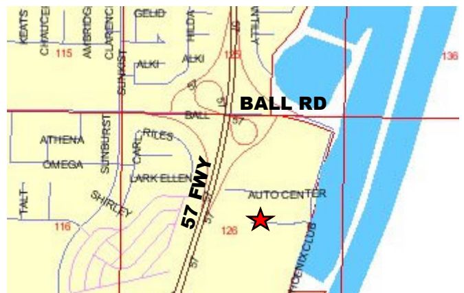
Freeway map to the Anaheim Equestrian Center

Free lunch and pony rides for Rotary Children!!!