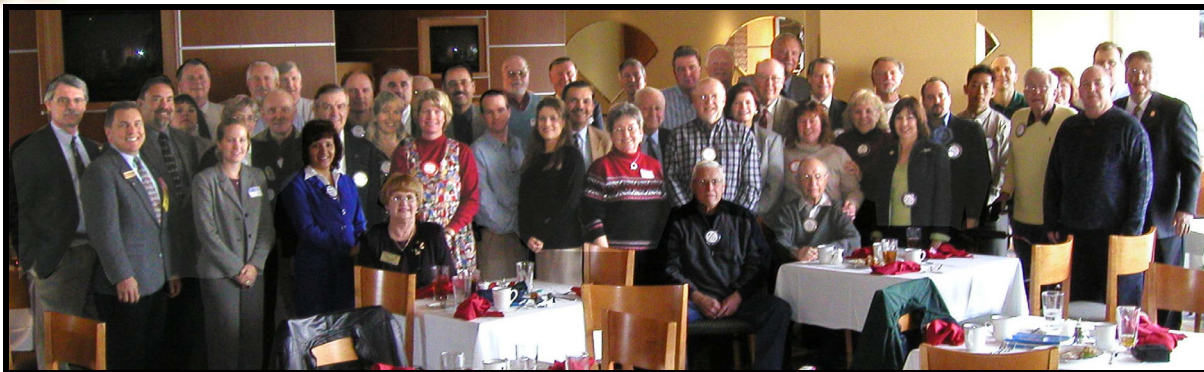
Group photo for the 99 th Birthday of Rotary International in conjunction with a club in Hungry as their centennial project.

The Anaheim Rotary Newsletter February 23, 2004