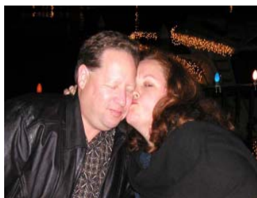
Still on their honeymoon?

(Dedication ceremony to be held the afternoon of February 23, 2005.)