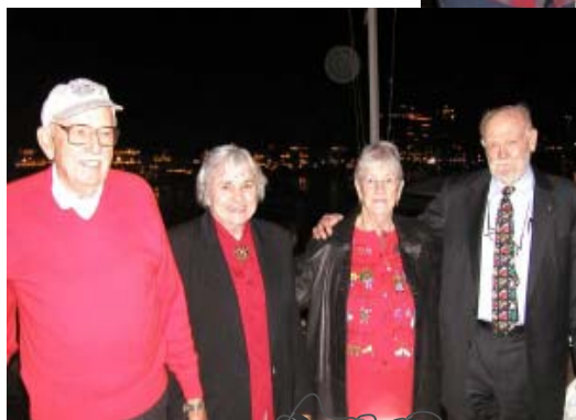
Smiles above, and smiles below . . . this party ROCKED! And the food was great!