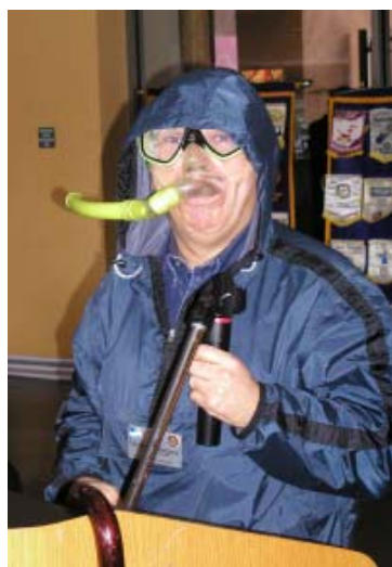
Talking into that mic will be a good trick!

Reminder: In observance of Martin Luther King Jr. Day, we will not be meeting this coming Monday, January 17.