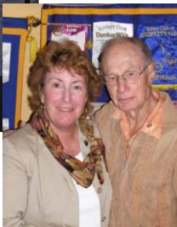
Weekly Squeak editors, past and present.