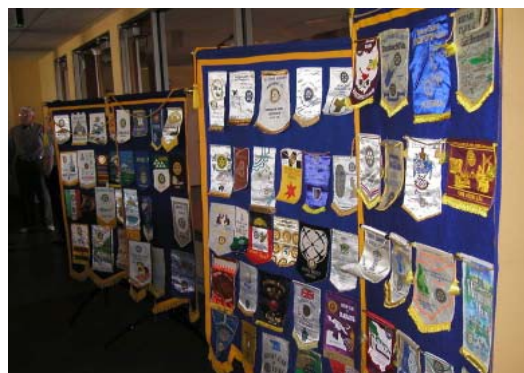
Another "banner" day at Anaheim Rotary!