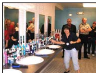
A legal peek into the men's john.