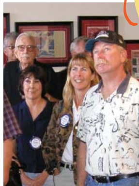
Paying rapt attention.