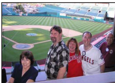
What a great view! Can we join the press corps?