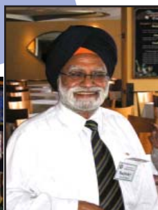
Visiting Rotarians from as near as Corona and as far as London, England!