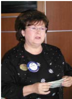
I have a new office!