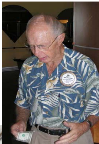
Hey, I can only afford one buck since I splurged on new clothes. I'm stylin' now!