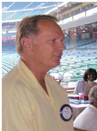
Fishing with my kids was the ultimate experience!