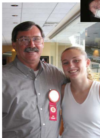
Now THIS is family!