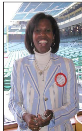
My daughter's going back to school!