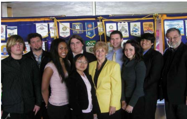
A group of winners, every one of them! Included in this photo are the teachers/coaches who spend many, many hours devoted to honing their students' skills.