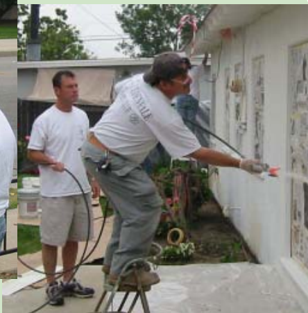
No, THIS is how it's done.