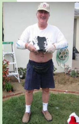
Showing one's abs is an important part of painting.