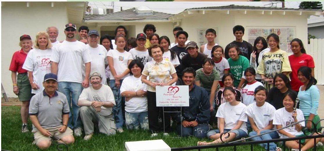
What a great group of workers! In all, six from Anaheim Rotary and 29 kids from Key Club and Youth Leadership Anaheim.