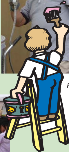
Back off, mister! The lady is wielding pink paint!