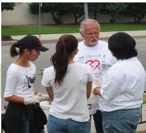
Okay, this is how it's done . . .