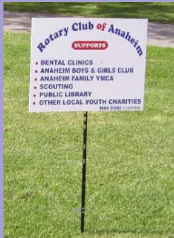
The ultimate T sign.