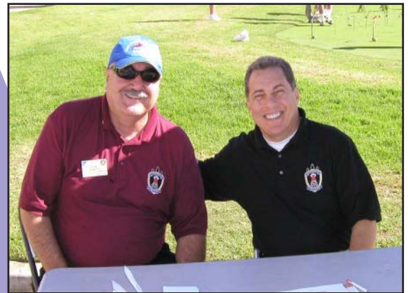
Beautiful weather, golf, relaxation, camaraderie . . . these smiles (both above and below) say it all!