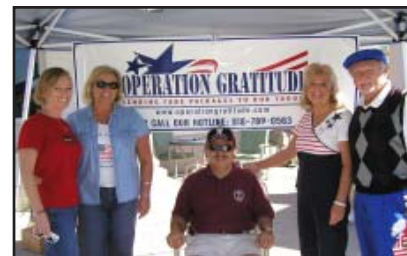
Our thanks to the volunteers who staffed the Operation Gratitude booth at our golf tournament.