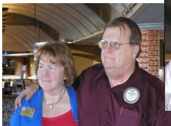
Happy Anniversary you two!