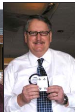
Maybe next time, Norm.